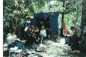
Witnessing in a Gypsy camp