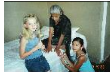
Ministering at the Nursing Home