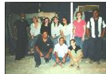
The Mexico II Team