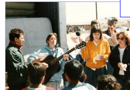
Street Meeting (1987)

God will give us this privilege until we die.