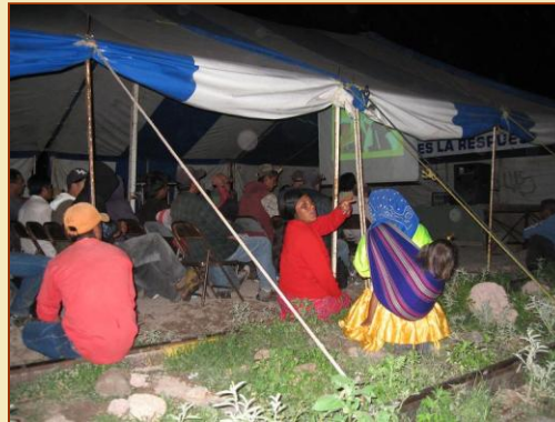
Showing movie. Indios really like it.

Being here you have mixed emotions or feelings. In one way you feel really sad for the condition of these people, but in contrast you may also feel a sense of holy wrath, wondering