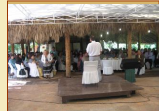
Ministering to a pastors and leaders conference in the beautiful Aguascalientes