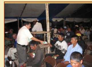
Milk instead of drug or alcohol.