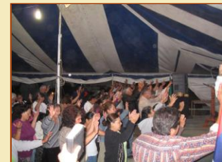
Call to salvation and to worship.