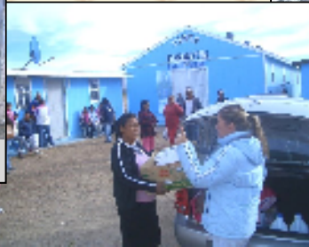
Donating food, too