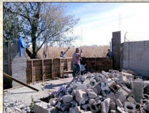
Repairing part of the cement wall around the new mission base.