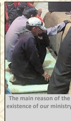
The main reason of the existence of our ministry