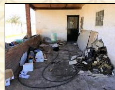
This is what we found outside. Working on it.