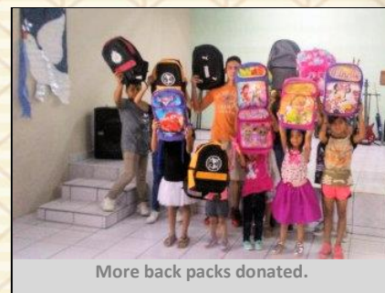
More back packs donated.