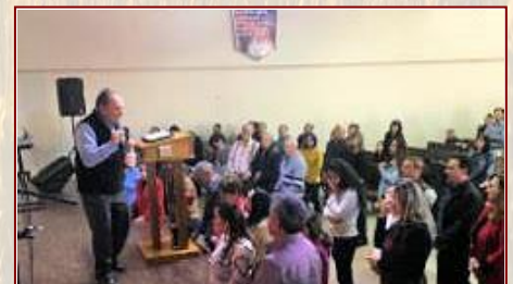
A call to serve