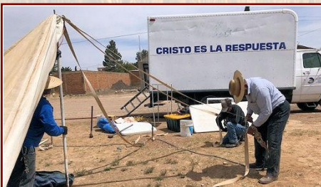
Preparing the net