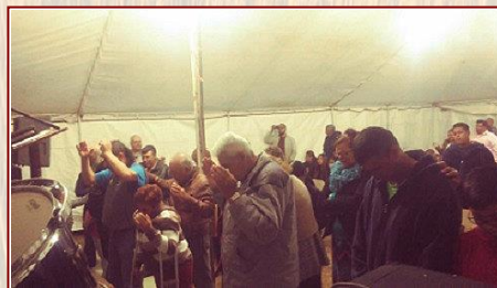
Blessed are those who .... shall be filled