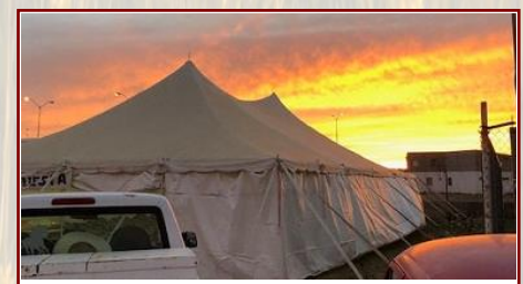
Guess who the artist is