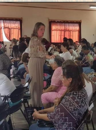
Ladies conference up on the mountains, organized by a Mennonite church.

And we pray for you, that God will keep, protect you,