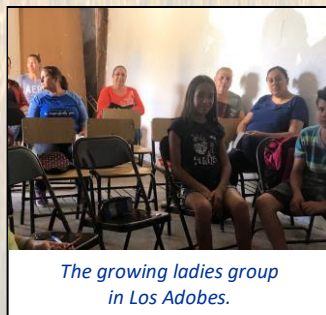
The growing ladies group in Los Adobes.

The other marvelous news is that the mission base is totally together with the notary fees. Thank God and thanks for the generous gifts and prayers of all who gave with love and sacrifice. What a relief!