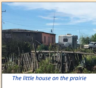
The little house on the prairie

We can only give thanks to our dear God for His great love and faithfulness.