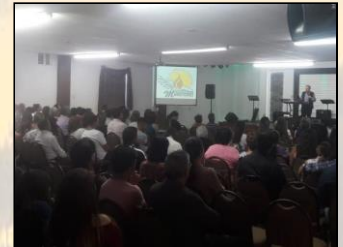
At church, God's people first.

Because we have some money left over, we will use it for property improvements and for the yearly distribution (already started), of back packs, school material and blankets.