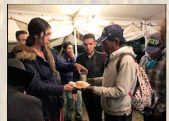
Never neglect needy people.