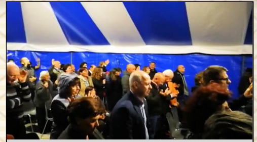
God can even use tents to draw people to him.