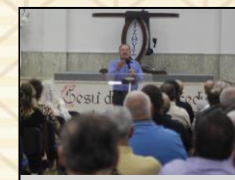
A blessed church.