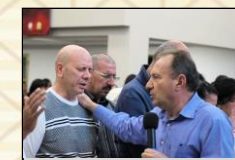
Yes, there are still people hungry and thirsty for God..