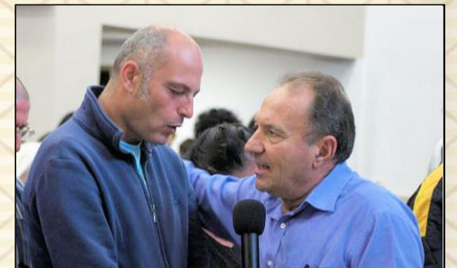
What a blessing to bring the Gospel to my fellow Italians who are hungry and thirsty for God.