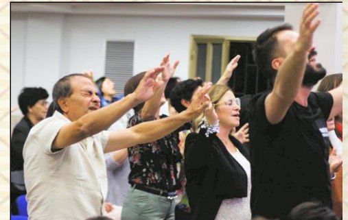
Beautiful people of God.