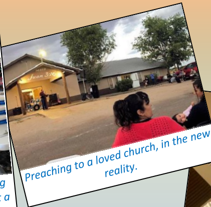
Preaching to a loved church, in the new reality.