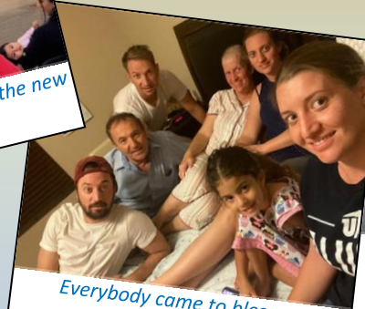
Everybody came to bless and encouraging mother.