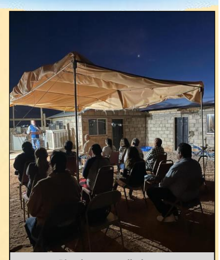
Big places, small places, every soul has value before God.