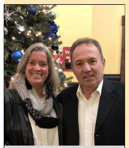
In loving memory, She is greatly missing.