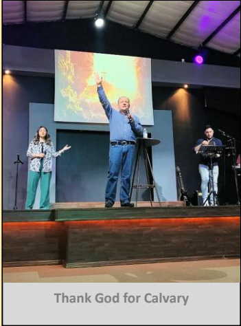
Thank God for Calvary