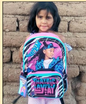
Thank you for your help in blessing others.