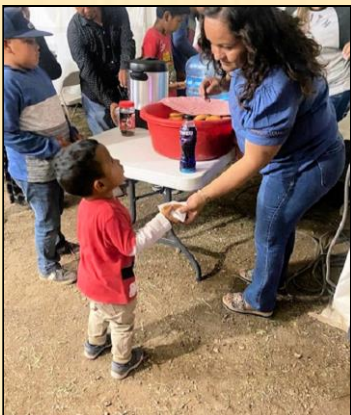
Children will always be an important part of our outreach