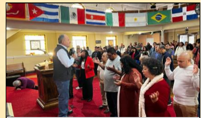
The family of God and the lost will always be our priority