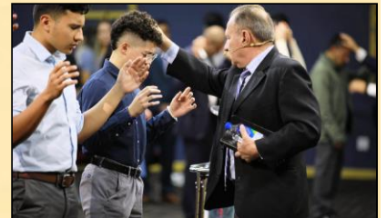
The Power of God: The preaching of the Gospel