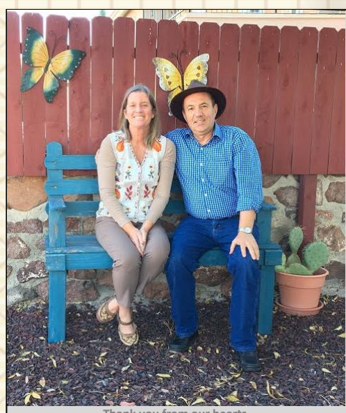
Thank you from our hearts.