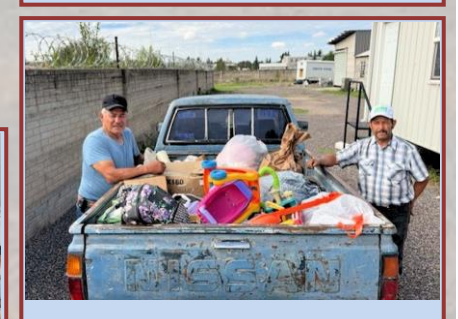
Loading a truck with all kinds of goodies and send to needy churches up on the mountains.