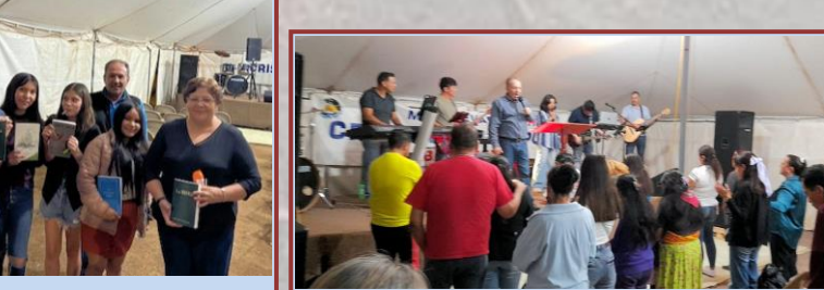
The tent, still works to catch fishes