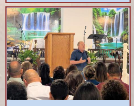
Never neglecting churches.